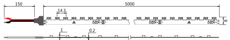
SMD5630 CC Strips Unit:mm